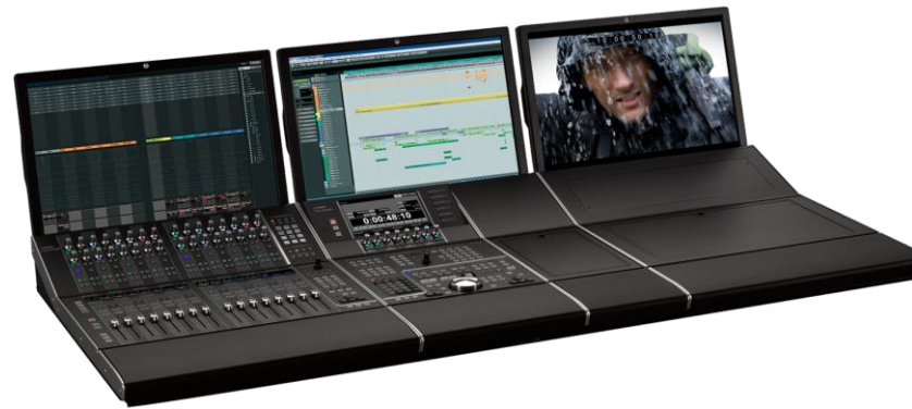
NUAGE DAW System